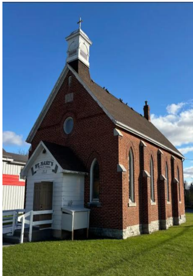
St. Mary's Church – Mission 131 Main Street Odessa, ON K0H 2H0

St. Patrick's Sunday at 11:00 a.m. St. Mary's Church Closed until further notice