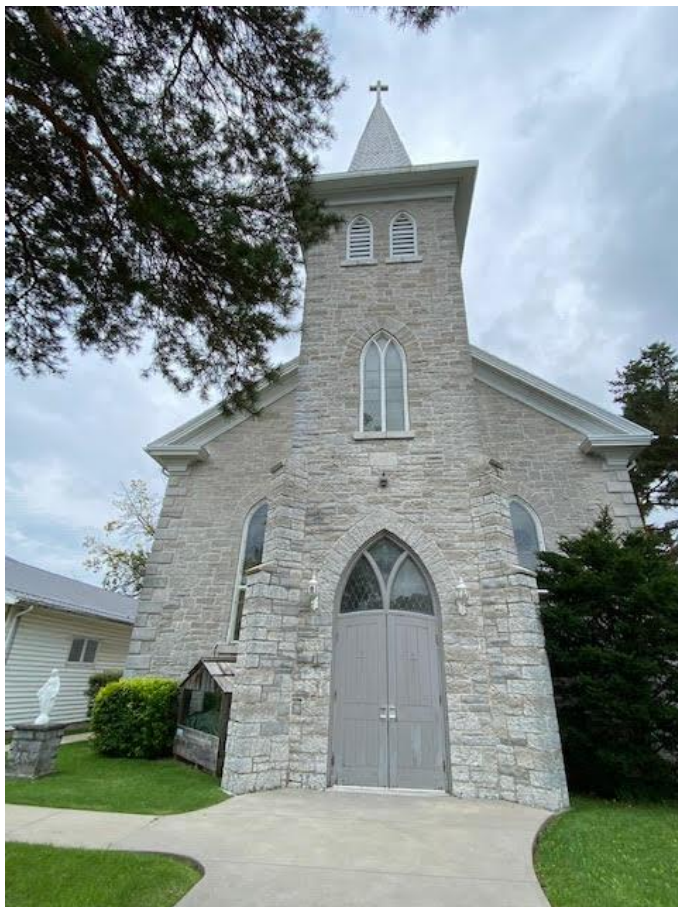
St. Patrick's Church 3977 Sydenham Rd, Sydenham, ON K0H 2W0