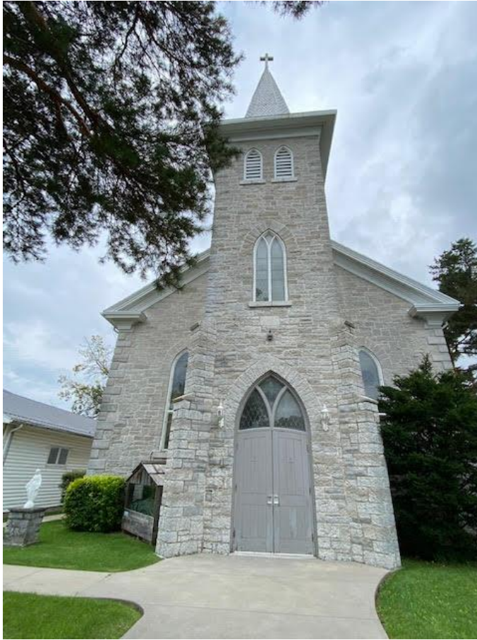
St. Patrick's Church 3977 Sydenham Rd, Sydenham, ON K0H 2W0