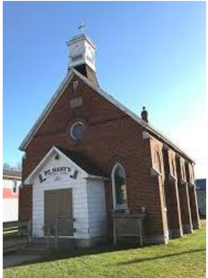
St. Mary's Church – Mission 131 Main Street Odessa, ON K0H 2H0