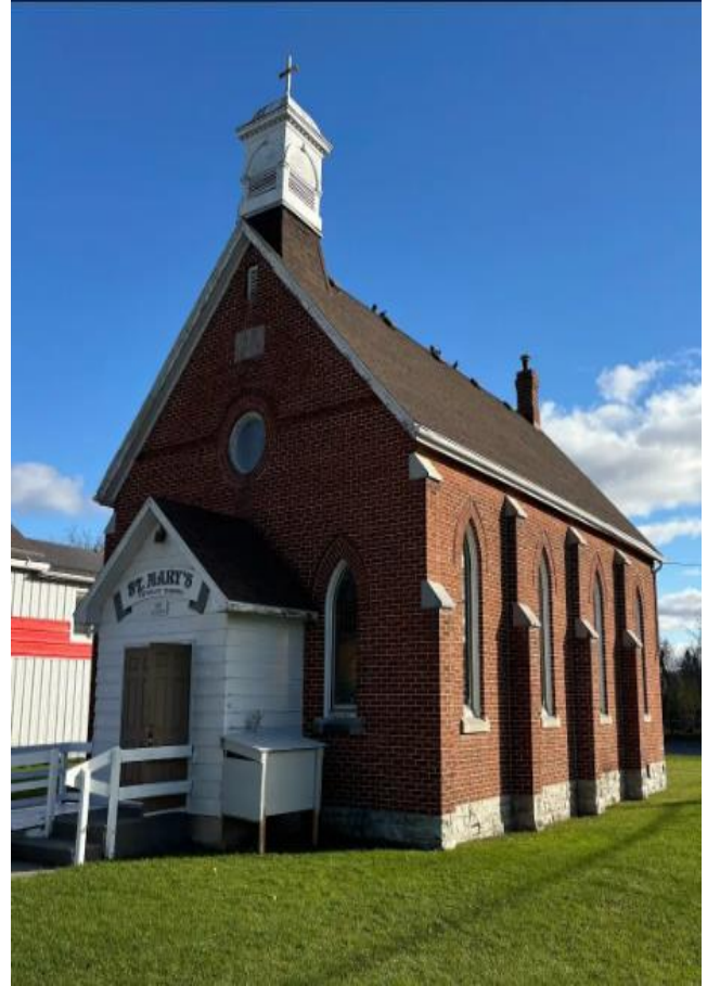
St. Mary's Church – Mission 131 Main Street Odessa, ON K0H 2H0