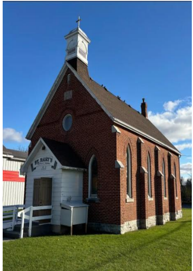
St. Mary's Church – Mission 131 Main Street Odessa, ON K0H 2H0