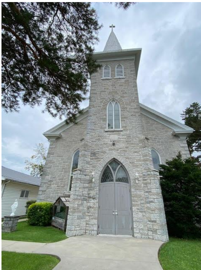
St. Patrick's Church 3977 Sydenham Rd, Sydenham, ON K0H 2W0