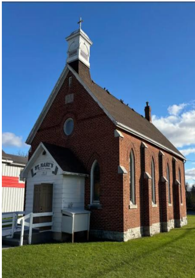
St. Mary's Church – Mission 131 Main Street Odessa, ON K0H 2H0