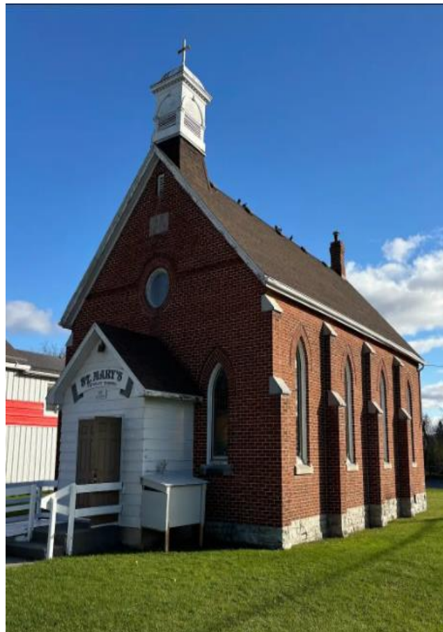
St. Mary's Church – Mission 131 Main Street Odessa, ON K0H 2H0