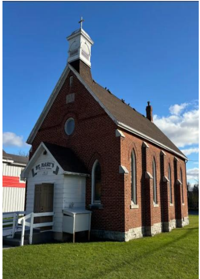
St. Mary's Church – Mission 131 Main Street Odessa, ON K0H 2H0