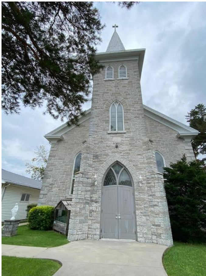
St. Patrick's Church 3977 Sydenham Rd, Sydenham, ON K0H 2W0