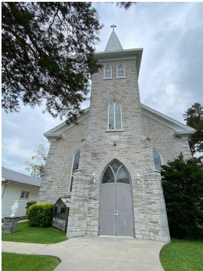
St. Patrick's Church 3977 Sydenham Rd, Sydenham, ON K0H 2W0