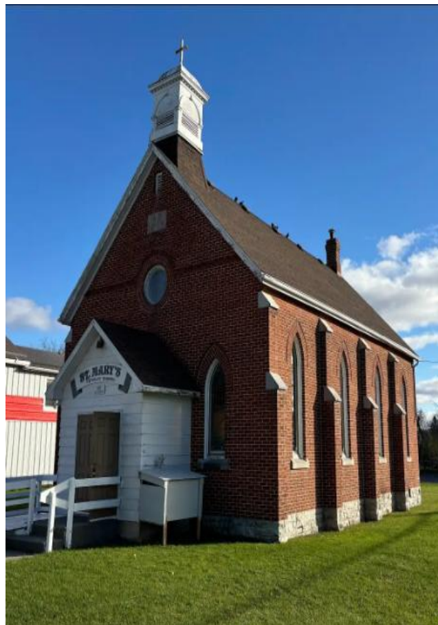
St. Mary's Church – Mission 131 Main Street Odessa, ON K0H 2H0

St. Patrick's Sunday at 11:00 a.m. St. Mary's Church Closed until further notice